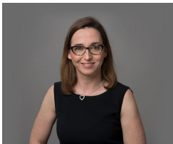
Elite Elkon Partner