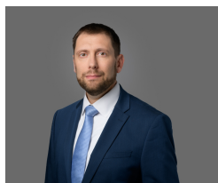
Timor Belan Partner