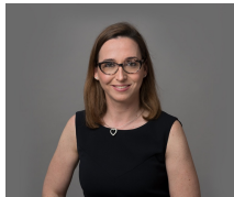
Elite Elkon Partner